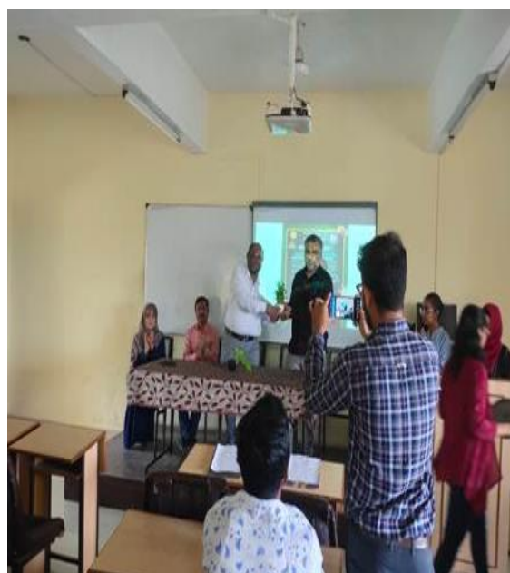
Felicitation of the judges