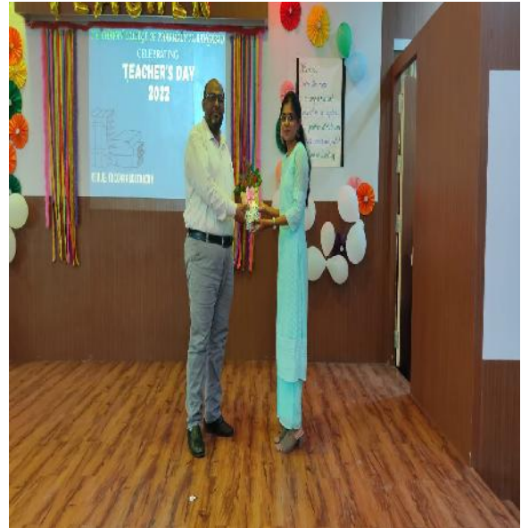
Felicitation of Principal