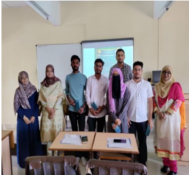
The Team Achievers- winning team Short film making competition