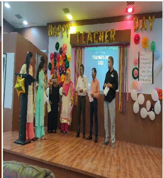
Felicitation of staff members