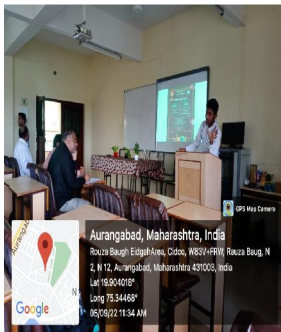
Participant sharing his review on the book