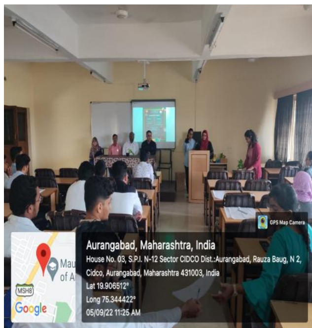
Book Reading Competition – Jury members with convenor and SPICES coordinator