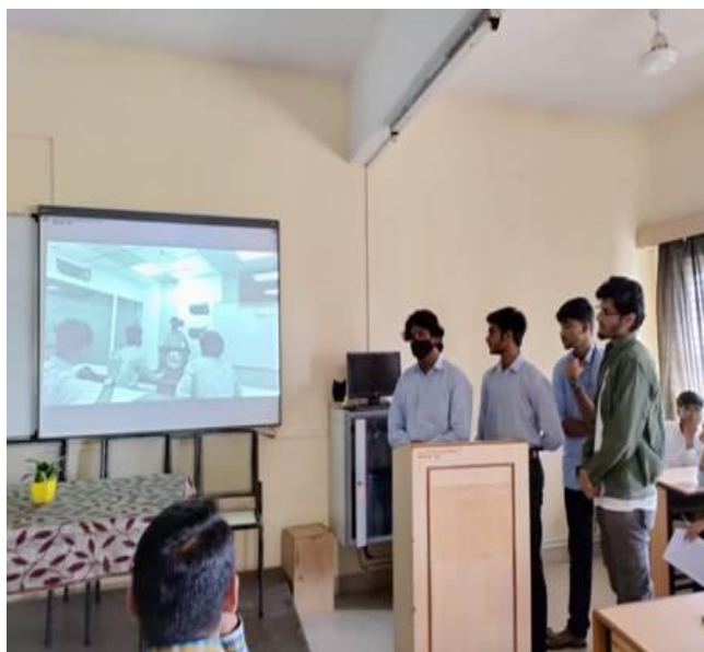
Participants presenting their short films