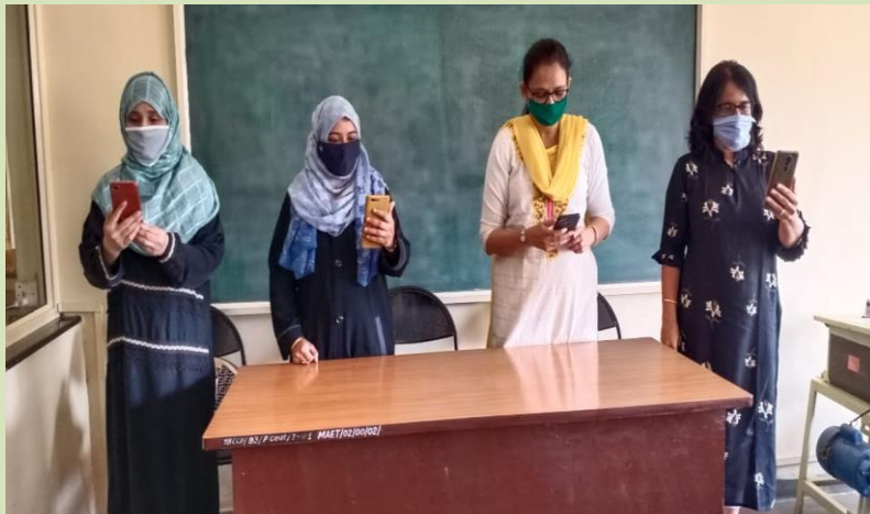
College Staff and Students are taking online Pledge