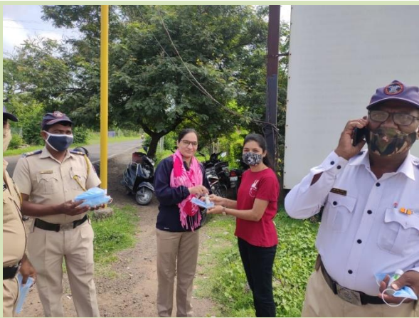
“Free Mask and Sanitizer Distribution to Police”