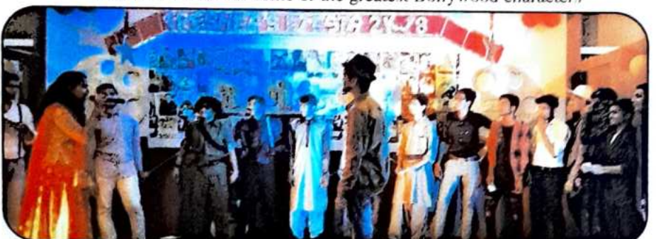
The SRK Fan Quiz during the Freshers Fiesta 2019