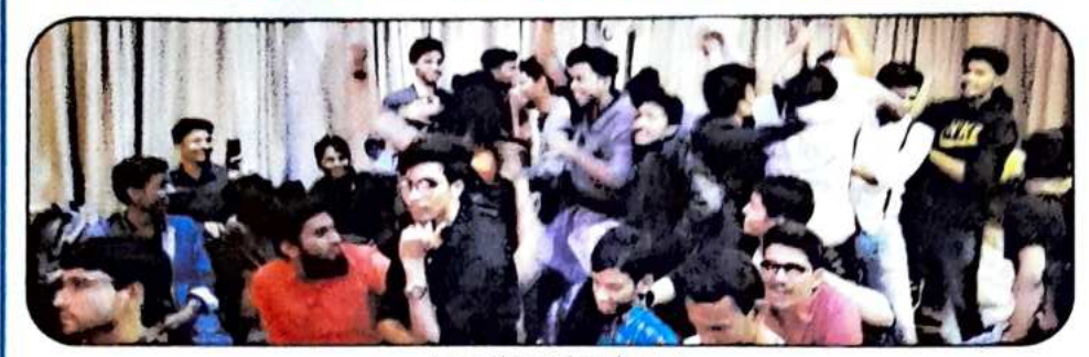
A section of audience