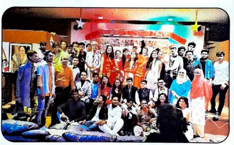
THE SOPHOMORES - The organising committee of Freshers' Fiesta 2019.