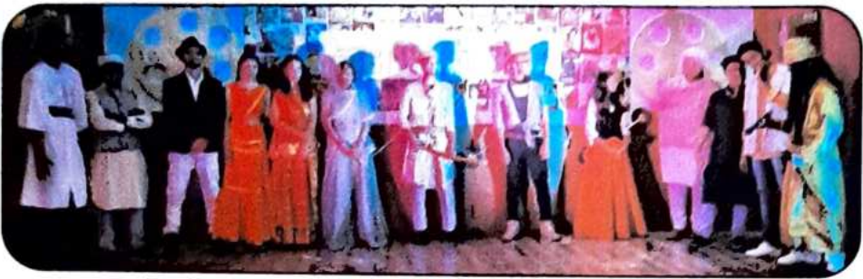
Freshers dressed as some of the greatest Bollywood characters