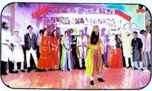
KAHANI FILMI HAI: The Bollywood character walk