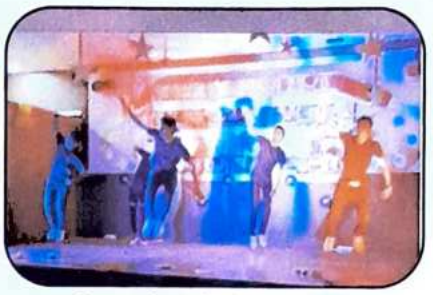
Group dance by Groovy Boys