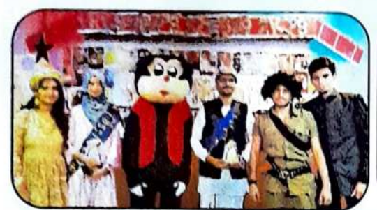
The finalists of the personality contest