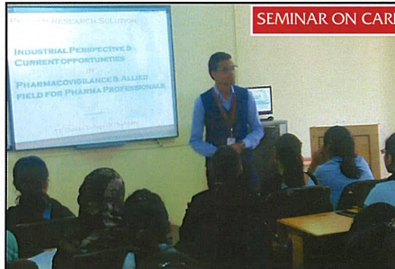
SEMINAR ON CAREER DEVELOPMENT

Induction session for the freshers was held to provide an insight into various departments in the college, functioning style. Various committee heads explained them about the role of their committees and the activities conducted. It was followed by a campus walkthrough.