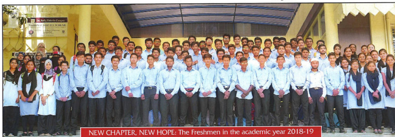
NEW CHAPTER, NEW HOPE: The Freshmen in the academic year 2018-19

and M Pharm courses with four specialties. Over the past several years, the college has transformed itself into one of the best institutions in the country,