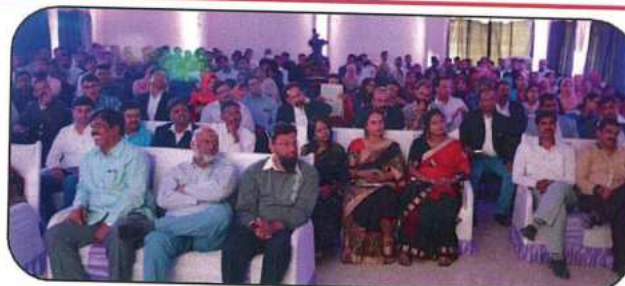
A section of the audience