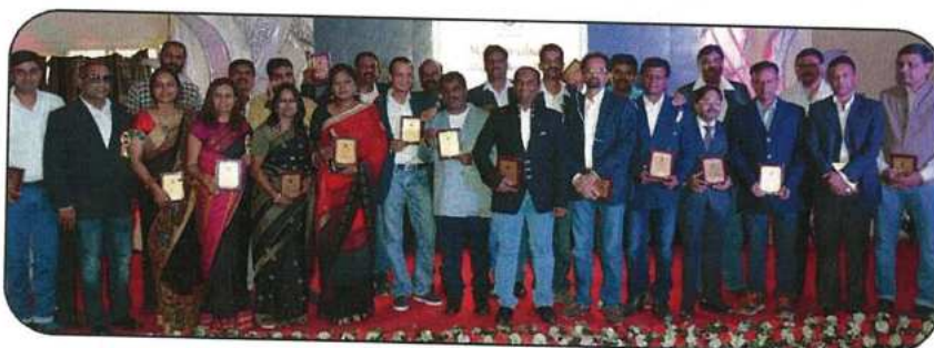
The second batch of YBCCP