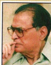
April 5 1920 – July 9, 2005