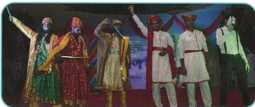
Participants of the Character Walk contest