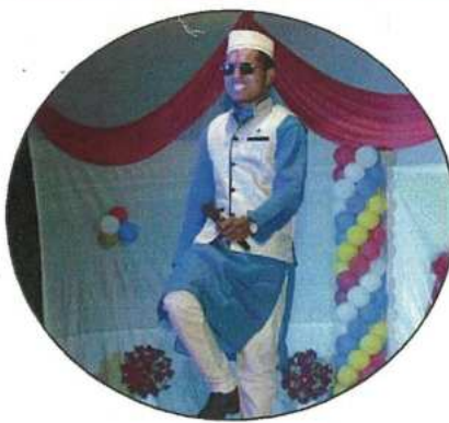
The Raja Babu Act