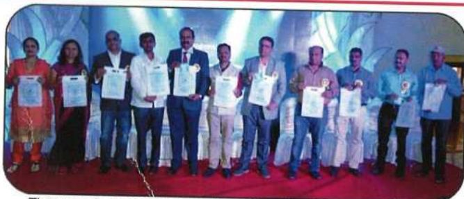
The executive committee members of the Alumni Association

of the association in college's development and appeal the alumni to register in the association. Some alumni shared their funny, serious and memorable anecdotes of their college days. Some alumni delivered beautiful speeches in which they shared their experience, to foster the