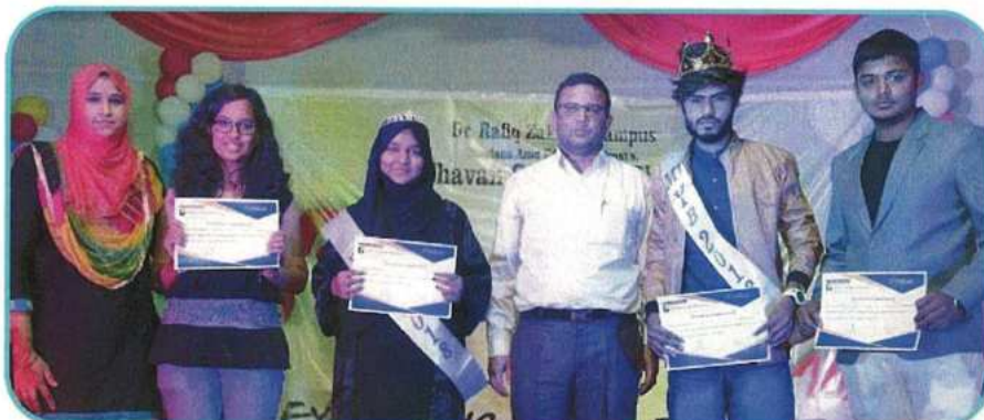
Winners of Mr and Miss YB Contest