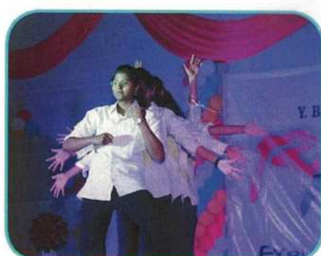
Group dance by 1st year girls