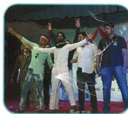
Drama by final year students