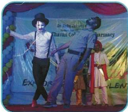
Character Walk contest in progress