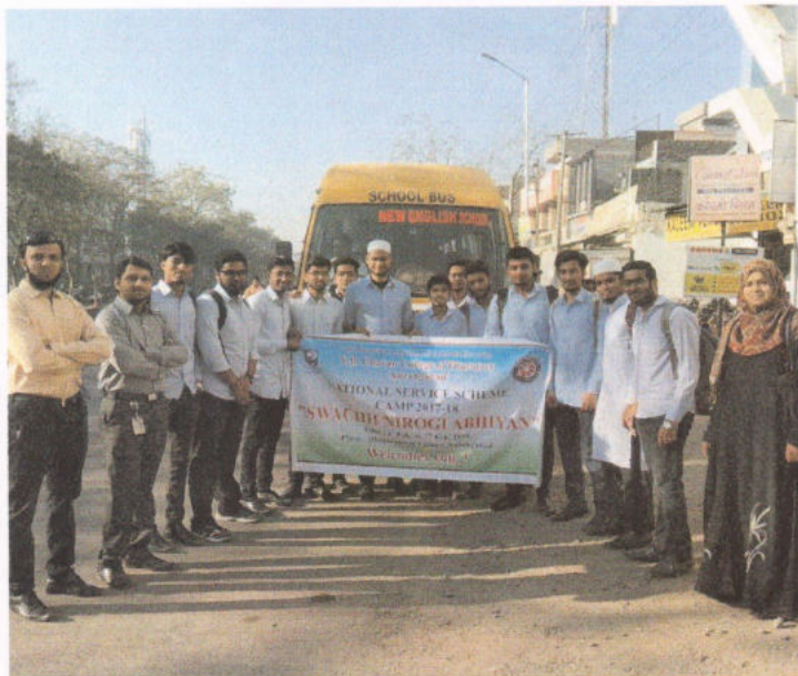
The National Service Scheme (NSS) team of Y B Chavan College of Pharmacy on the first day of the 7-day camp at Dhopteshwar village in Aurangabad.