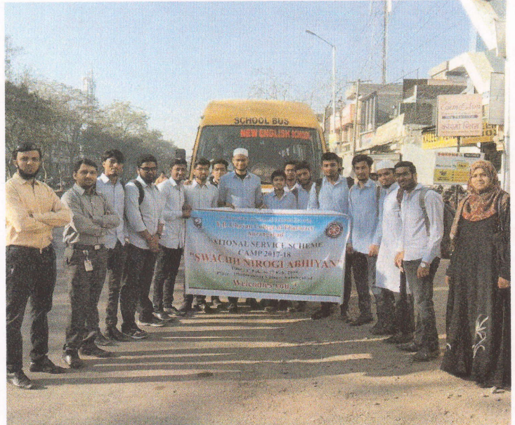
The National Service Scheme (NSS) team of Y B Chavan College of Pharmacy on the first day of the 7-day camp at Dhopteshwar village in Aurangabad.